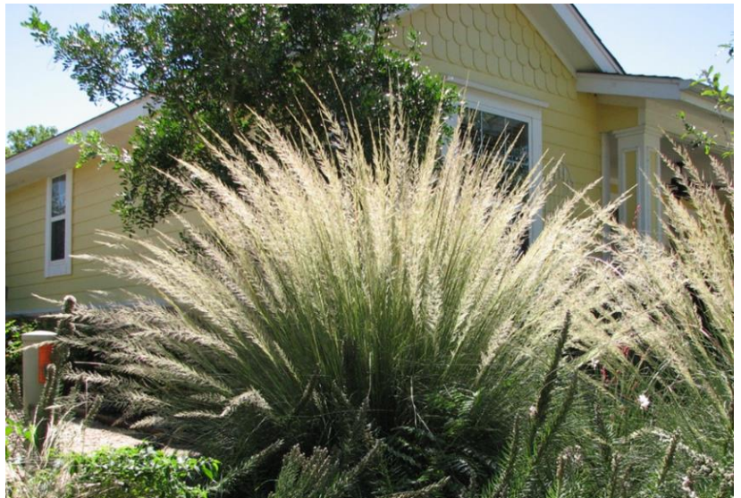
Lindheimer muhly, Muhlenbergia lindheimeri

Once their roots are established, native plants growing in their ecosystem can survive on the rainfall they receive—no irrigation necessary. They also have long root systems that not only help the plants survive dry spells but also channel rain deeply into the soil, where it can be stored for future use. Those roots also help to clean the water as it soaks into the ground. This is an important feature when recharging our aquifer.