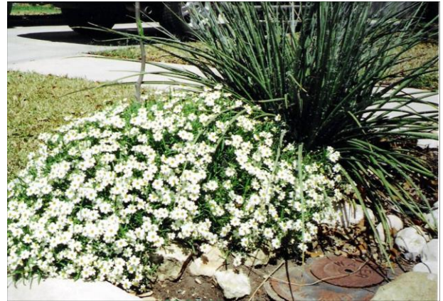
Fertilizer will kill Blackfoot daisy, planted here with Red yucca. Good soil, organic mulch, and watering will also significantly shorten the daisy’s life. Benign neglect is best.