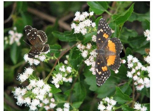
Texas Crescent and Bordered Patch butterflies on fall blooming White mistflower.

Do you enjoy attracting butterflies, hummers, birds, and other animals to your yard? Did you know that natives will attract more critters than non-native plants because the critters and plants co-evolved and are perfectly suited to each other? The plants provide food and shelter for the creatures that make up the ecosystem.