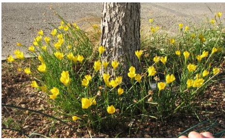
Yellow Rain Lily