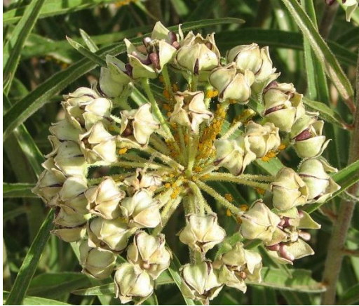
The yellow aphids on this Antelopehorn milkweed do not need treatment. The plant will not die from aphids, but pesticides will kill caterpillars and butterflies.

Did you know that natives are money-savers for your budget because they not only require less water and maintenance, but they also need no synthetic fertilizers or pesticides because they are adapted to local soils and pests with no help from you? Cha-ching. In fact you can “burn-out” some native plants if they are treated too well; once established, benign neglect is often the only care from you required. A little compost and mulch will take care of most natives.