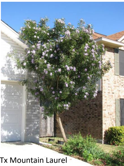
Tx Mountain Laurel

Everyone loves our beautiful wildflowers, but are you aware that other natives are equally beautiful—and help Central Texas look like Central Texas!