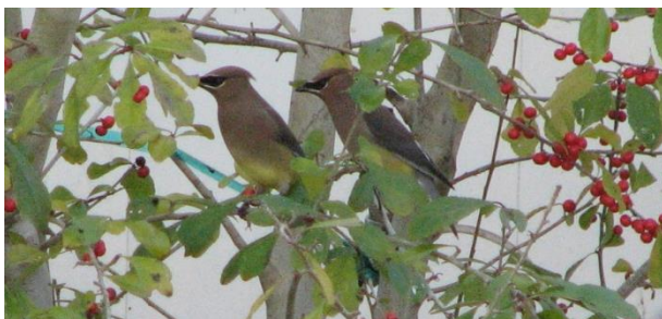
Cedar Waxwings on Possumhaw tree. They can strip the berries, gobbling them quickly.